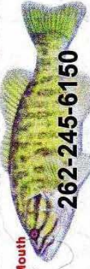
Small Mouth Bass